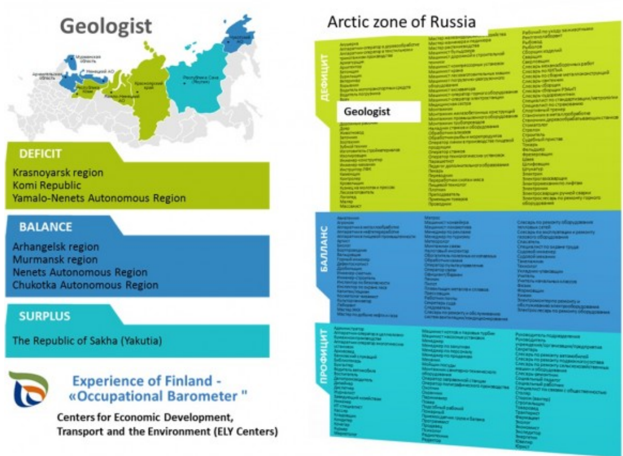
Figure 3 - Occupational barometer

Симакова А. В., Стенусь И. С. Recruitment needs for the Russian Arctic zone development // StudArctic Forum. 2017 № 3(7) average salary, professional qualities, necessary knowledge and skill and other categories (Figure 3). The advantage of developed «Occupation chart» is that information is presented using infographics in an attractive and «user-friendly» way, which is especially important when working with younger generation (Figure 4) [8].