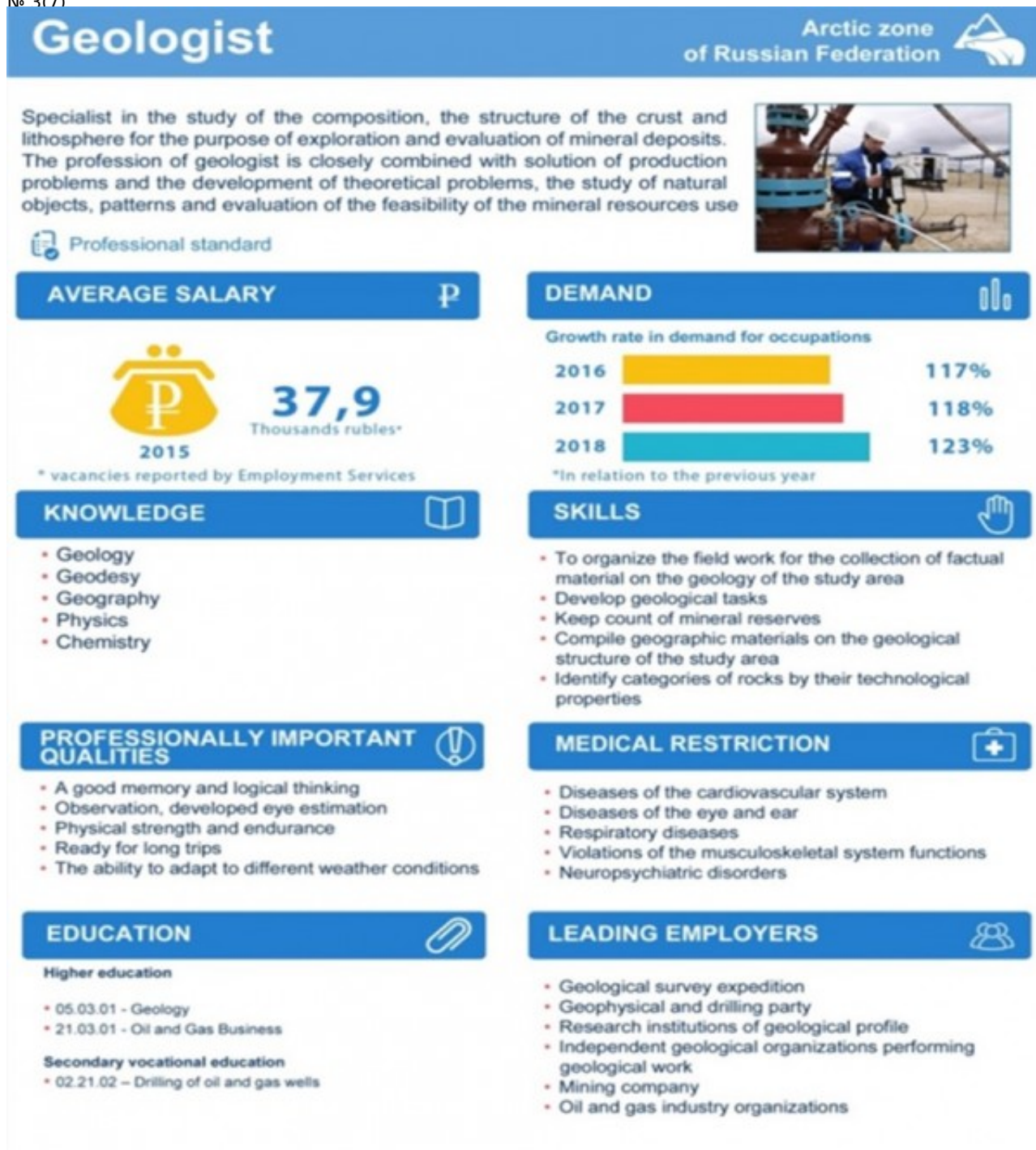
Figure 4 - Occupation chart

We suggested a comprehensive approach to solve the problem of the Russian Arctic Zone's staffing needs. The main solution is dissemination of information on labour market situation for target groups' awareness.