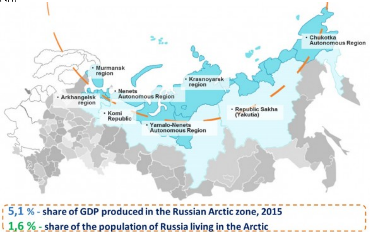
Figure 1 - Territories of the Russian Arctic zone

The structure of the economy of the Russian Arctic differs from the average Russian. The economy of the Arctic regions is directed to the extraction of minerals, their processing and transportation. In all Russian Arctic regions, the area «Mining» prevails, which constitutes one third of the Gross Regional Product (GRP) of the macroregion. The identification of development priorities allows to take into account the tendencies of development of economic structures for the future, which should become a reference point for the training system in order to meet the actual request from the economy.