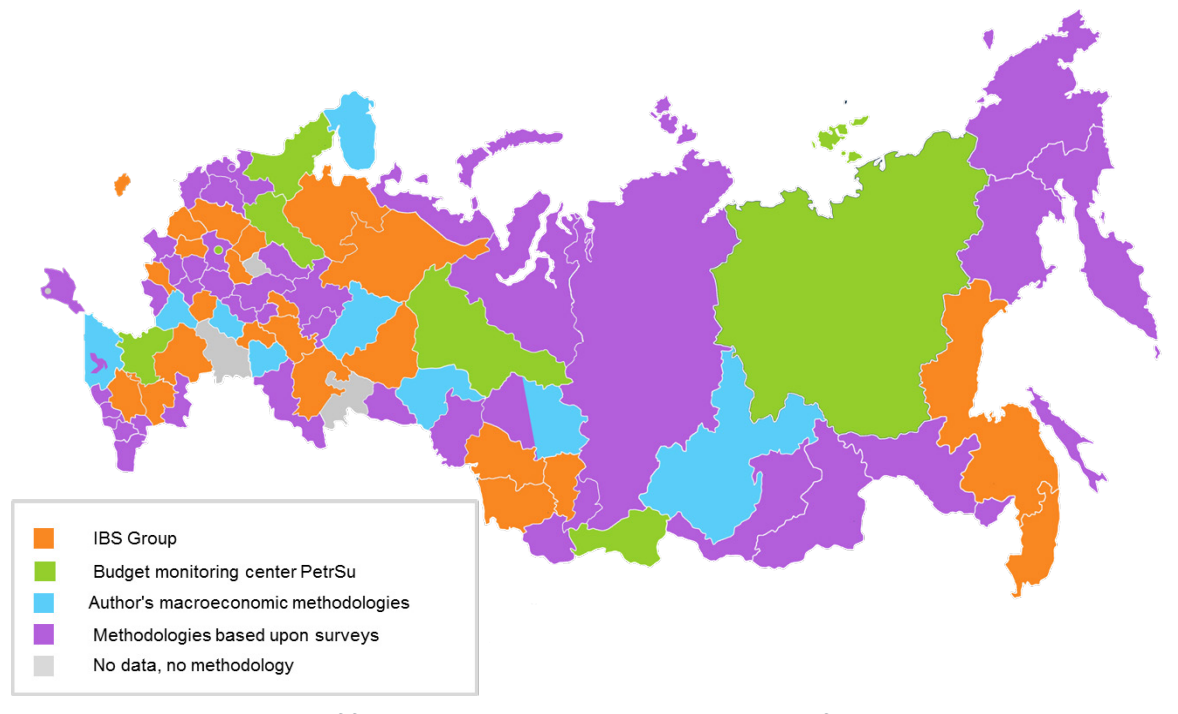
Figure 1. Types of forecasting recruitment needs in regions of the Russian Federation

Figure 1 shows the geographic spreading of different forecasting methods for recruitment needs across Russia selected regions according to the principle of uniqueness and universality.