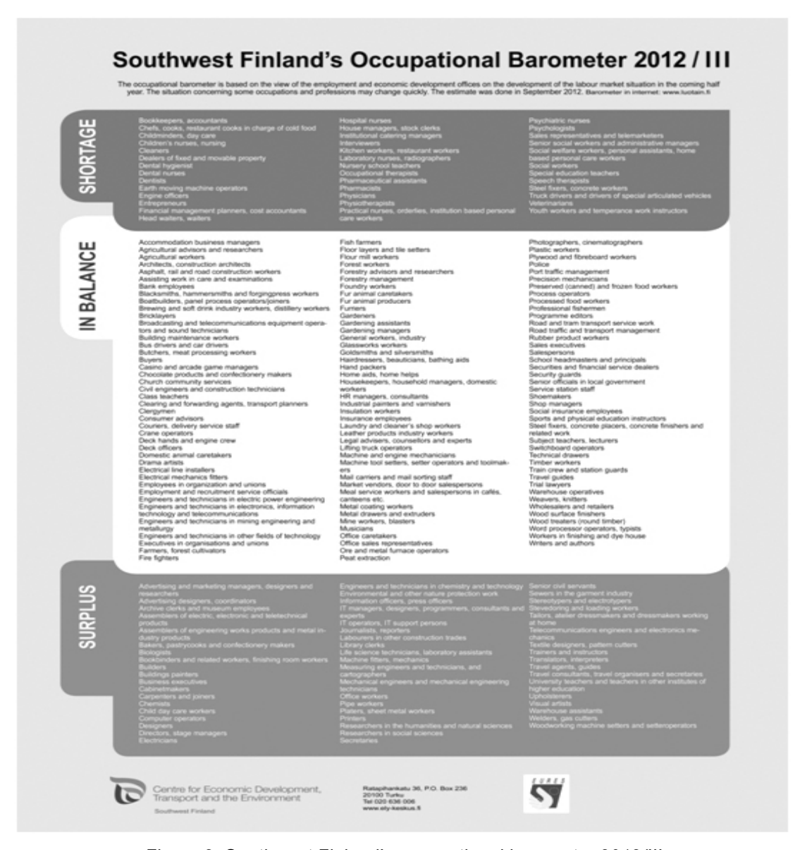
Figure 2. Southwest Finland's occupational barometer 2012/III

Let's consider an example of such barometer for one of the Finnish regions (Fig.2).